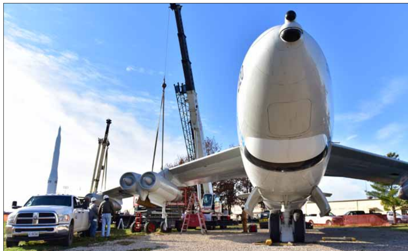
Left: Civil Engineers survey the area as a wing of a Boeing B-47 Stratojet static display aircraft is placed onto beams at Whiteman Air Force base, Mo., Dec. 6, 2016. The wings were removed prior to transporting the aircraft to reduce weight and lower the risk of unseen hazards.