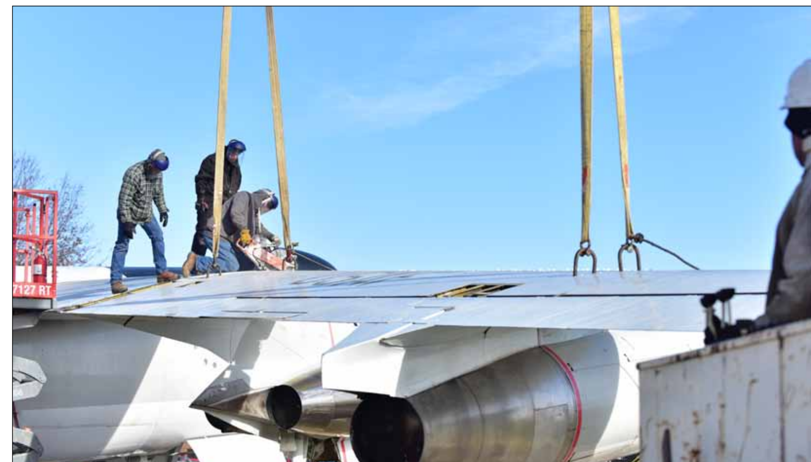
Several civil engineers work together to remove the wings of a Boeing B-47 Stratojet static display aircraft Dec. 6, 2016. The static display is scheduled to be a part of the new Heritage Museum at Whiteman.