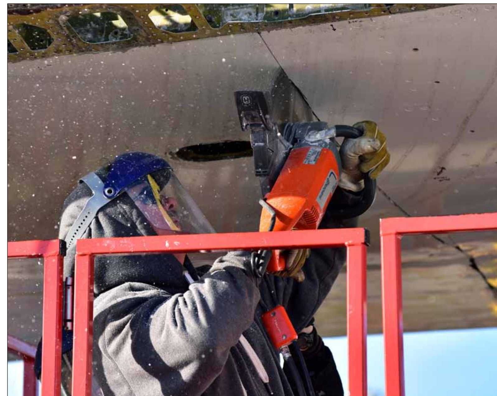
A craftsman uses a power circular saw to make the initial cuts to the wing of a Boeing B-47 Stratojet static display aircraft at Whiteman Air Force Base, Mo., Dec. 6, 2016. The aircraft is scheduled to be moved to be a part of the new heritage park.