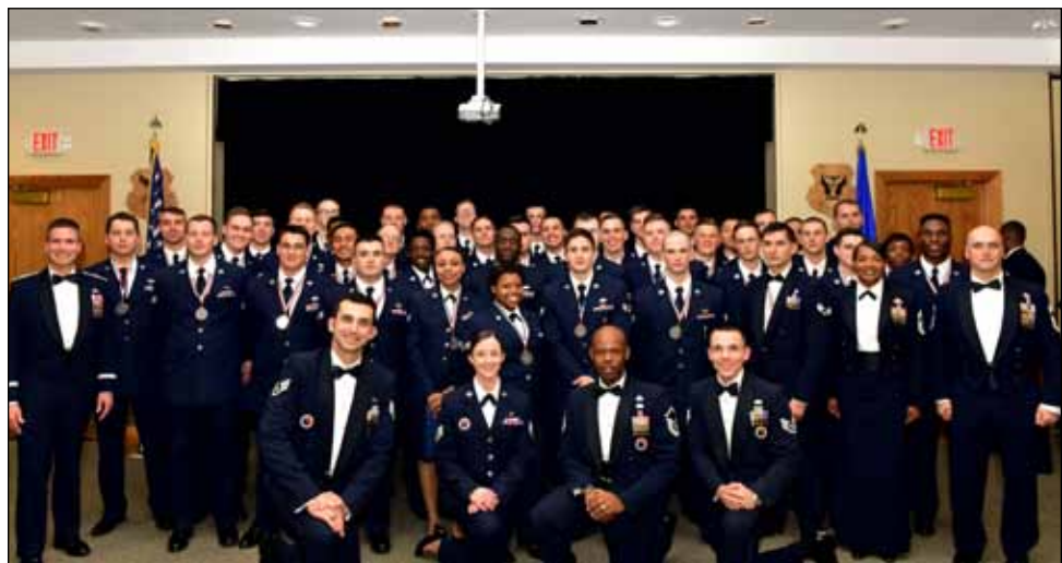
Graduates of Whiteman Airman Leadership School (ALS) class 17-A gather for a class photo after a graduation ceremony at Whiteman Air Force Base, Mo., Dec. 8, 2016. ALS is a five-and-a-half week-long course that prepares senior airmen to supervise and lead Air Force teams, which supports the employment of air, space and cyber-space power.