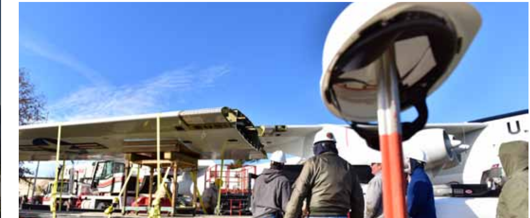
Below: Several civil engineers work together to remove the wings of a Boeing B-47 Stratojet static display aircraft Dec. 6, 2016. The static display is scheduled to be a part of the new Heritage Museum at Whiteman.